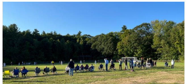
Moore School hosted our first soccer game on school grounds on September 15, 2022. This is the first game that has been hosted at the School in many years.